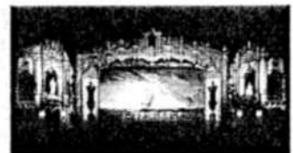
Akron Civic Theatre 2,585 seats

Since 1973, Thomas Hall has been the leading performing arts complex and cultural center.