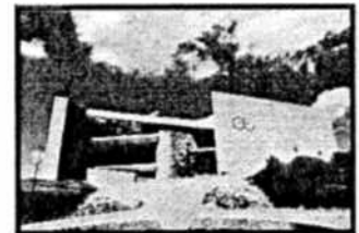
E. J. Thomas Hall 2,955 seats